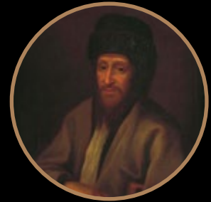
Rabbi Jacob Emden