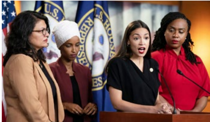
The self-proclaimed “Squad” stands with Hamas

This war is no different. The outpouring of support for Israel from the West has already waned dramatically. America and its European allies are alarmed at the possibility of this conflict widening to encompass the entire Middle East. And they are all mired in internal protests from loud and violent Muslim and Progressive agitators. President Biden, who declared “America stands with Israel” when they began their own just war, has wavered in his support due to political pressure from Leftists in the Democratic party. He has even apologized for calling out Hamas’ lies.