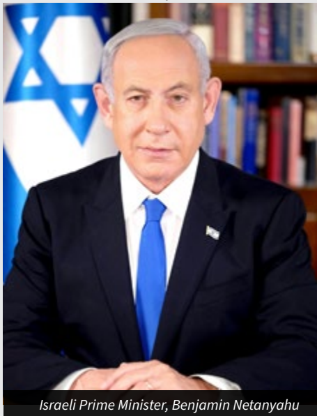
Israeli Prime Minister, Benjamin Netanyahu

In stark contrast, Hamas uses its civilians as human shields. Thus, it launches rockets from the roofs of hospital and schools, and when Israel announces targets, Hamas forces civilians to the target areas so that they can use their dead bodies for propaganda purposes. As one expert has put it, “Israel uses its military to protect its citizens whereas Hamas uses its citizens to protect its military.”