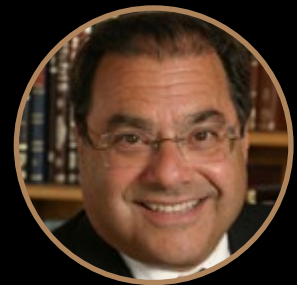
Rabbi Shlomo Riskin